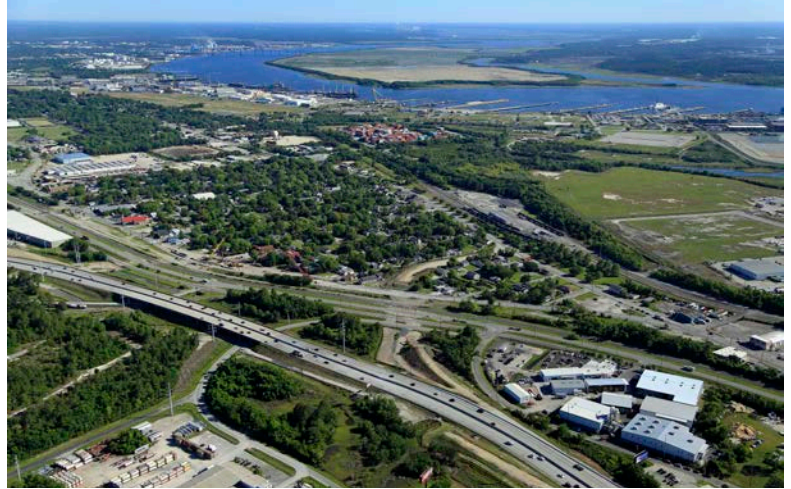
Photo 1: An aerial view of the project area before work gears up across the site.