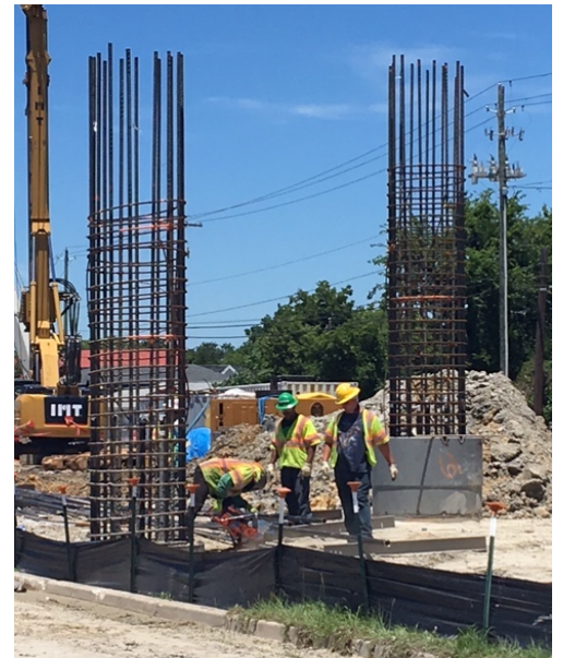
Photo 3: Tied rebar extends above drilled shafts in preparation for column construction this month.

For more project information, please contact the SCDOT Port Access Road Project Office at 843-580-8801 scportaccessroad@gmail.com www.SCPortAccessRoad.com